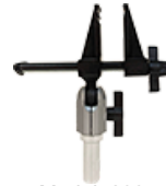
Model: 203 PV Jr. Head