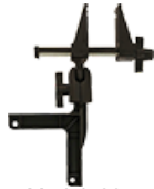
Model: 207 Vise Buddy Jr.