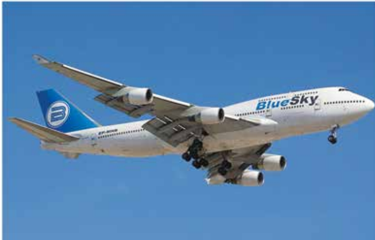
One of the aircraft exported to Iran by the Balli Group, et al. 8

The Penalty: On May 11, 2010, Balli Aviation was sentenced to a $2 million criminal fine and corporate probation for five years. On February 4, 2010, Balli Group PLC and Balli Aviation entered a civil settlement with BIS and OFAC, which includes a civil penalty of $15,000,000, of which $2,000,000 was suspended pending no further export control violations. In addition, a five-year denial of export privileges was imposed on Balli Aviation and Balli Group which was suspended provided that during the suspension period neither Balli Aviation nor Balli Group commits any future violations and paid the civil