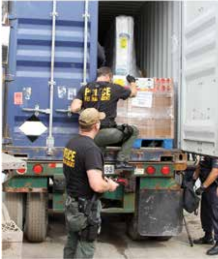
OEE Special Agents conducting an inspection.