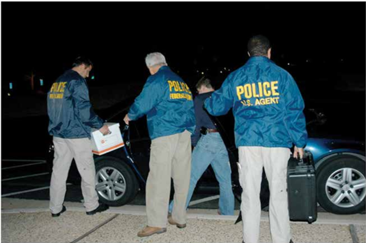
OEE Special Agents executing a warrant.

The Penalty: In August 6, 2009, DHL agreed to pay a civil penalty of $9,444,744 and conduct external audits covering exports to Iran, Syria and Sudan from March 2007 through December 2011.