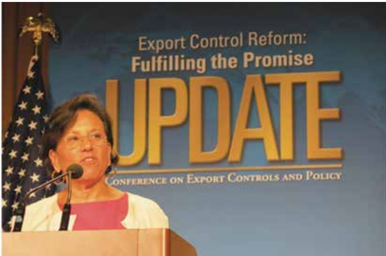
Secretary Pritzker at BIS's 2013 Update Conference describing how Export Control Reform will simplify controls on insignificant military items that have the same utility as their commercial variant, as demonstrated by certain military and commercial aircraft switches.

A party to an export transaction may be subject to criminal and/or administrative sanctions for making false statements to the U.S. Government in connection with an activity subject to the EAR. Most frequently, the false statements are made on an export document or to a federal law enforcement officer. Common types of false statements seen by BIS are statements on a Shipper's Export Declaration or AES Electronic Export Information filing that an export is destined for one country when it is really destined for a sanctioned destination, the export does not require a license (i.e., that it is "NLR") when in fact a license is required for the shipment, false item valuations and statements that an export was shipped under a particular license number when in fact that license was for a different item. False statements that are made to the U.S. Government indirectly through another person, such as a freight forwarder, constitute violations of the EAR.