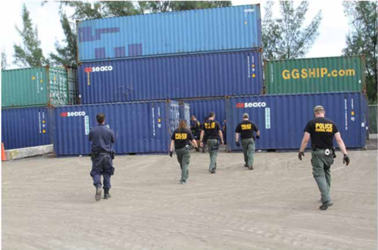
OEE Special Agents conducting inspections with Customs and Border Protection Officers.