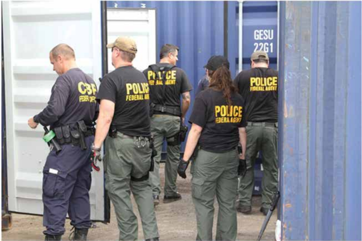
OEE Special Agents conducting a joint inspection with Customs and Border Protection Officers.